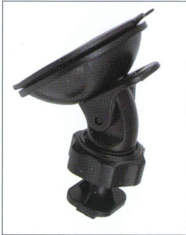
Suction Cup Bracket

The CDR 810 should be mounted to the windshield using the included Suction Cup Mount. Make sure to line the unit up so that it has a clear view of the road. If you are rotating the camera to view the cab, make sure to change the Rotate Setting to ON in the Tools Menu.